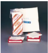
Cod. FORMC269 CUT GAUZE PAD 20X20CM - 1KG