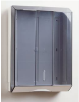
Cod. FORRT280 PAPER TOWELS "C" FOLDED UP DISPENSER