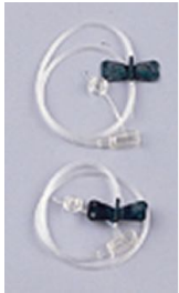
Cod. FORST139 WING NEEDLE 23G 100PCS