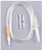
Cod. FORST331 PHLEBOCYCLE TUBES WITH RUBBER WITHOUT NEEDLE