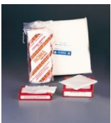
Cod. FORMC270 CUT GAUZE PAD 30X30CM - 1KG