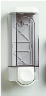
Cod. FORRT250 LIQUID SOAP DISPENSER REFILLING VERSION 0,8L