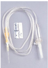
Cod. FORST332 PHLEBOCYCLE TUBES WITH RUBBER WITH NEEDLE