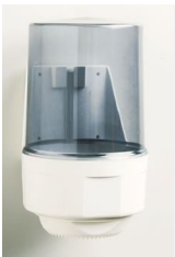
Cod. FORRT320 MINI ROLL-BOX DISPENSER